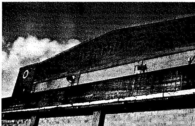
Left, Photo #1; right, Photo #3.

That leads to an interesting development, but that's another story. ○